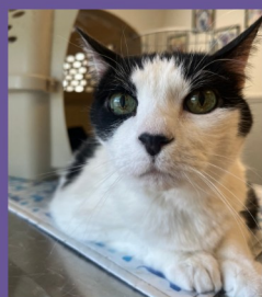
Boris | Male | 14 years

Don't miss the fun and do your holiday shopping locally!